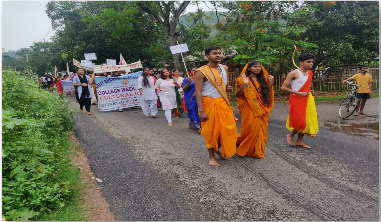
College Week Cultural Rally